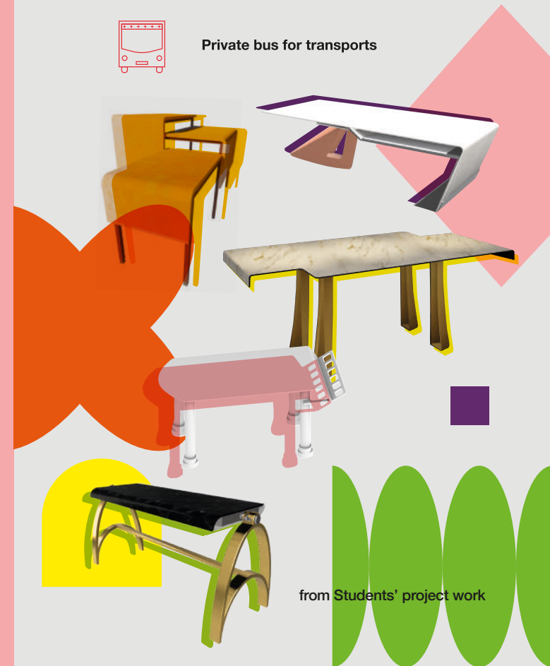
from Students' project work